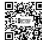
Ironclad® H2O Pro™ Ball Drop Test Video

12lbs. Ball Drop test on our H2O Pro™ Shower Fixture