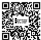
Ironclad® VR Pro™ Flame Test Video

Flame test on our VR Pro™ Correctional Cell Fixture