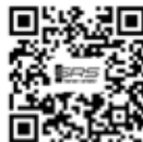
Ironclad® VR Pro™ Hammer Test Video

Flame test on our VR Pro™ Correctional Cell Fixture