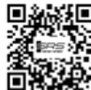
Ironclad® VR Pro™ Chemical Cleaner Video

Hammer test on our VR Pro™ Correctional Cell Fixture